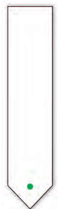
Fig. 23.1 Loading of pigment extract