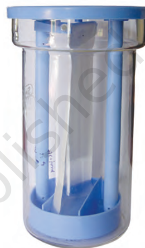
Fig. 23.2 Experimental setup of the chromatography