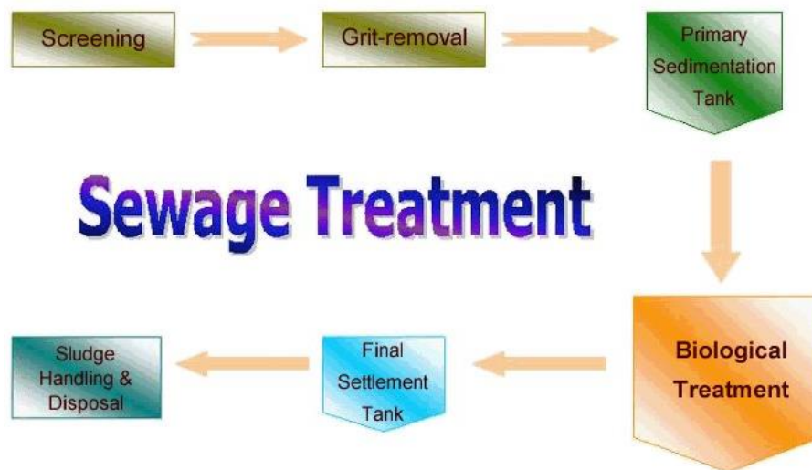
Fig.3. Sewage treatment steps

Primary treatment- physical removal of small and large particles through filtration and sedimentation begins the process of primary treatment. Firstly, sequential filtration removes debris. Then sedimentation removes the soil and small pebbles. The left over known as effluent is taken for secondary treatment.