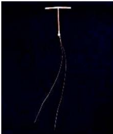
Figure 4.2. Copper T (CuT)

These devices are ideal contraceptives for the females for family planning and are among the most widely used methods of contraception.