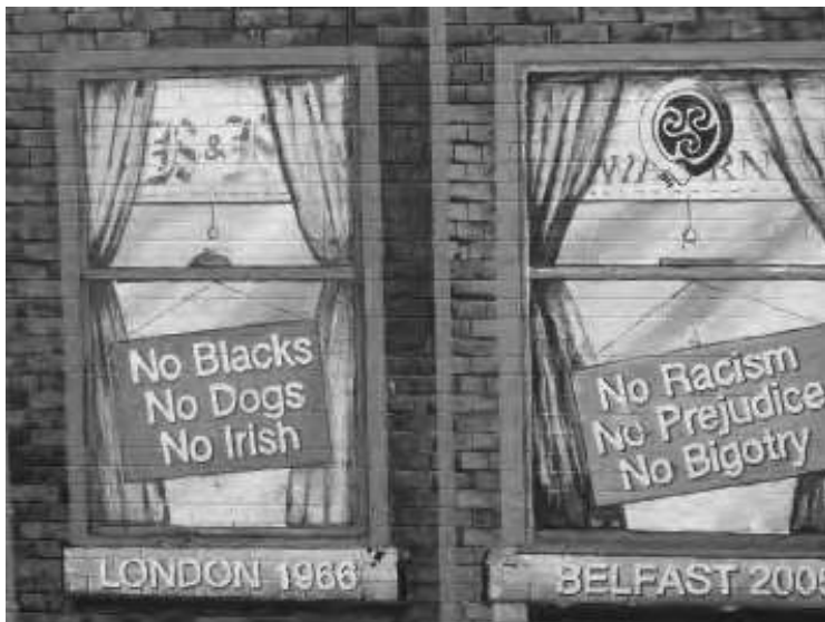
In some societies of Northern Ireland, the colonies of Protestant and Catholic communities are divided by walls. These walls are sometimes filled with graffiti as you can see here. The Irish Republican Army and British Government signed an agreement in 2005. What does the graffiti here tell about the conflict in the society?

Second, it depends on how political leaders raise the demands of any community. It is easier to accommodate demands that are within the constitutional framework and are not at the cost of another community.