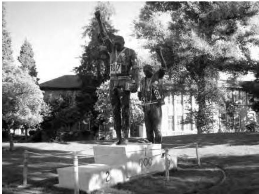
In 2005, the San Jose State University installed a 20-foot high sculpture representing the protest by Tommie Smith and John Carlos. A photograph of the original medal ceremony in 1968 is on the top.

Do you think that Carlos and Smith should have raised an internal matter of American society in an international forum? Would you say that what they did was political? Why do you think Peter Norman, who was neither Black nor American, joined in the gesture of protest? If you were in Norman's place what would you do?