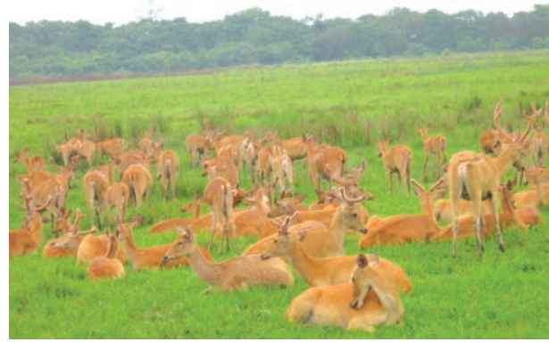
Fig. 2.4: Rhino and deer in Kaziranga National Park

horned rhinoceros, the Kashmir stag or hangul , three types of crocodiles – fresh water crocodile, saltwater crocodile and the Gharial , the Asiatic lion, and others. Most recently, the Indian elephant, black buck ( chinkara ), the great Indian bustard ( godawan ) and the snow leopard, etc. have been given full or partial legal protection against hunting and trade throughout India.