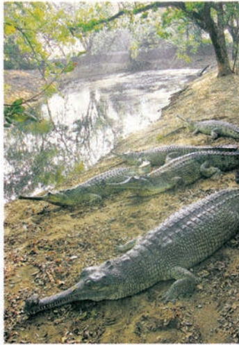
CRITICALLY ENDANGERED: Captive gharial at the Madras C

W ISPY tendrils of mist rise delicately from the water surface, tinged gold by the dawn. Your breath hangs as little clouds of vapour as you gaze upon the Girwa River on a cold winter morning. A trio of hollow clapping sounds from the other side of the river, half a kilometre away tells you that an adult male gharial is advertising his presence. It is the height of the breeding season. The place seems trapped in a time in early history when man was still clad in animal skins. It is only as the sun rises higher and burns the mist off the water that the world comes into focus with appalling clarity. The five-km stretch of the Girwa River in Katarniaghat Wildlife Sanctuary is one of the only three wild breeding sites left in the world for the most unique of all the