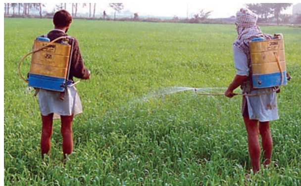
Fig. 4.18: Problems associated with heavy pesticide use are widely recognised in developed and developing countries

Can you name any gene modified seed used vastly in India?