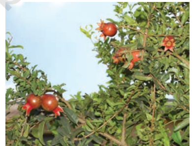
Fig. 4.12: Apricots, apple and pomegranate

Horticulture Crops: In 2014 India was the second largest producer of fruits and vegetables in the world after China. India is a producer of