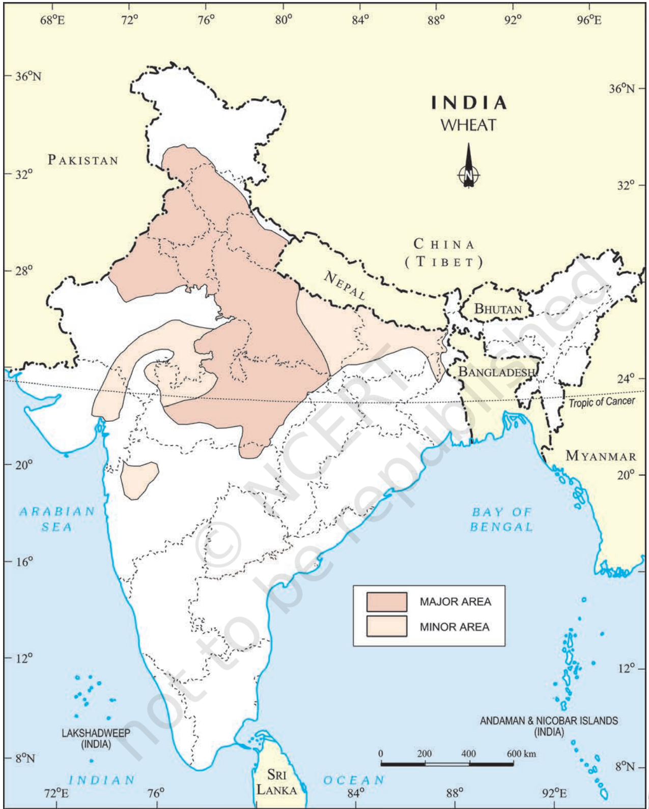
India: Distribution of Wheat