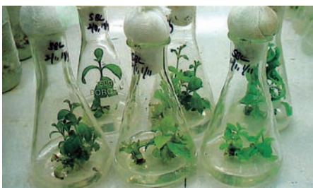
Fig. 4.17: Tissue culture of teak clones

Under globalisation, particularly after 1990, the farmers in India have been exposed to new challenges. Despite being an important producer of rice, cotton, rubber, tea, coffee, jute and spices our agricultural products are not able to compete with the developed countries because of the highly subsidised agriculture in those countries.