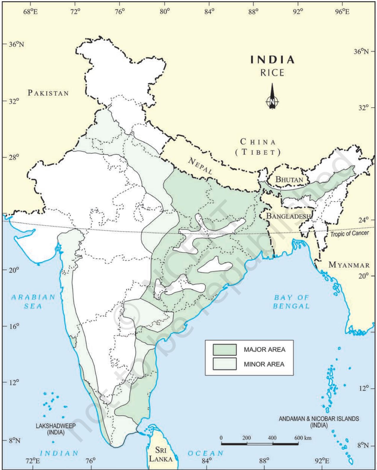
India: Distribution of Rice