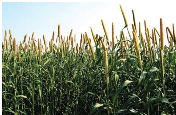
Fig. 4.6: Bajra Cultivation

Bajra grows well on sandy soils and shallow black soil. Major Bajra producing States are Rajasthan, Uttar Pradesh, Maharashtra, Gujarat and Haryana. Ragi is a crop of dry