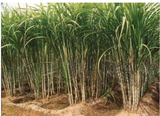
Fig. 4.8: Sugarcane Cultivation

Sugarcane: It is a tropical as well as a subtropical crop. It grows well in hot and humid climate with a temperature of 21°C to 27°C and an annual rainfall between 75cm. and 100cm. Irrigation is required in the regions of low rainfall. It can be grown on a variety of