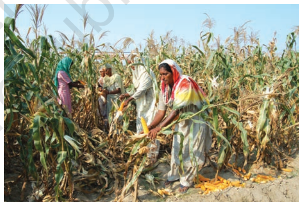
Fig. 4.7: Maize Cultivation

Maize: It is a crop which is used both as food and fodder. It is a kharif crop which requires temperature between 21°C to 27°C and grows well in old alluvial soil. In some states like Bihar