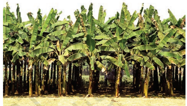
Fig. 4.2: Banana plantation in Southern part of India

In India, tea, coffee, rubber, sugarcane, banana, etc., are important plantation crops. Tea in Assam and North Bengal coffee in