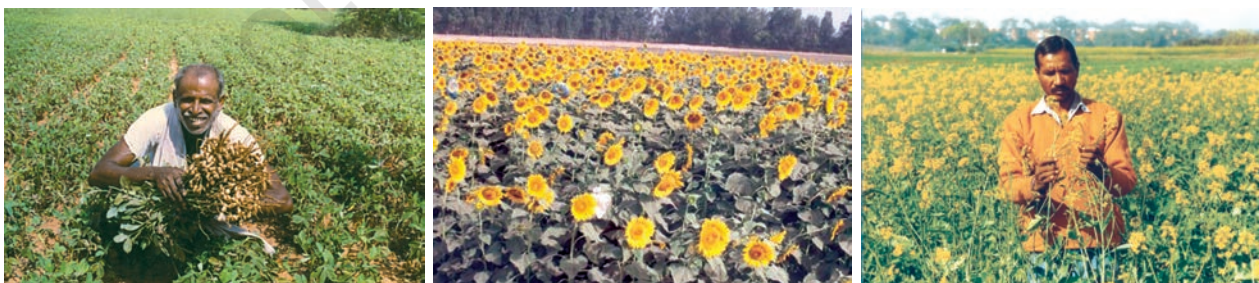
Fig. 4.9: Groundnut, sunflower and mustard are ready to be harvested in the field

Tea: Tea cultivation is an example of plantation agriculture. It is also an important beverage crop introduced in India initially by the British. Today, most of the tea plantations are owned by Indians. The tea plant grows well in tropical and sub-tropical climates endowed with deep and fertile well-drained soil, rich in humus and organic matter. Tea bushes require warm and moist frost-free climate all through the year. Frequent showers evenly distributed over the year ensure continuous growth of tender leaves. Tea is a labour-intensive industry. It requires abundant,