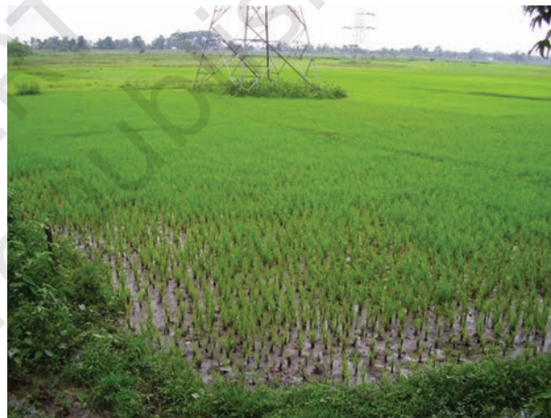
Fig. 4.4 (a): Rice Cultivation

Rice is grown in the plains of north and north-eastern India, coastal areas and the deltaic regions. Development of dense network