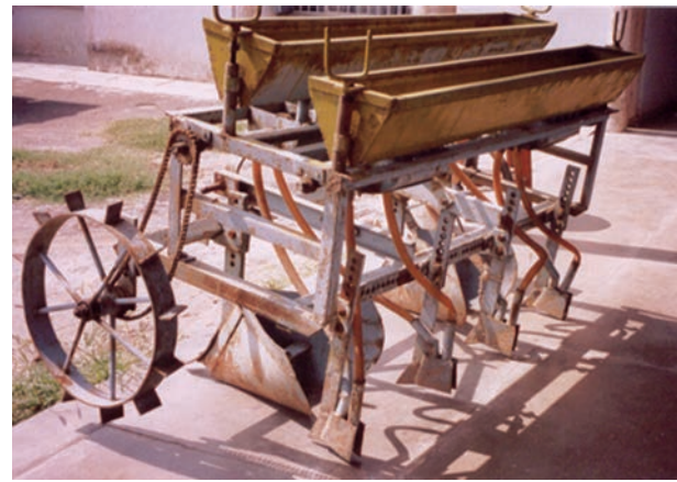
Fig. 4.16: Modern technological equipments used in agriculture

institutional reforms. Thus, collectivisation, consolidation of holdings, cooperation and abolition of zamindari, etc. were given priority to bring about institutional reforms in the country after Independence. 'Land reform' was the main focus of our First Five Year Plan. The right of inheritance had already led to fragmentation of land holdings necessitating consolidation of holdings.