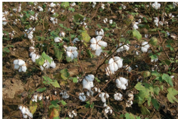
Fig. 4.15: Cotton Cultivation

Cotton: India is believed to be the original home of the cotton plant. Cotton is one of the main raw materials for cotton textile industry. In 2014 India was second largest producer of cotton after China. Cotton grows well in drier parts of the black cotton soil of the Deccan