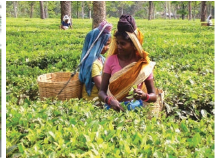
Fig. 4.11: Tea-leaves Harvesting

tropical as well as temperate fruits. Mangoes of Maharashtra, Andhra Pradesh, Telangana, Uttar Pradesh and West Bengal, oranges of Nagpur and Cherrapunjee (Meghalaya), bananas of Kerala, Mizoram, Maharashtra and Tamil Nadu, lichi and guava of Uttar Pradesh and Bihar, pineapples of Meghalaya, grapes of Andhra Pradesh, Telangana and Maharashtra, apples, pears, apricots and walnuts of Jammu and Kashmir and Himachal Pradesh are in great demand the world over.