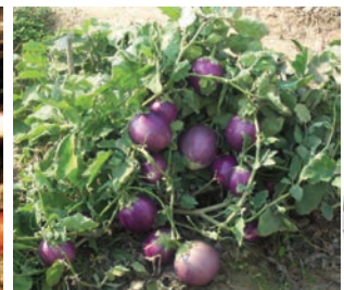
Fig. 4.13: Cultivation of vegetables – peas, cauliflower, tomato and brinjal