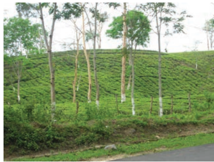
Fig. 4.10: Tea Cultivation

Coffee: In 2014 India produced 3.5 per cent of the world coffee production. Indian coffee is known in the world for its good quality. The Arabica variety initially brought from Yemen is produced in the country. This variety is in great demand all over the world. Initially its cultivation was introduced on the Baba Budan Hills and even today its cultivation is confined to the Nilgiri in Karnataka, Kerala and Tamil Nadu.