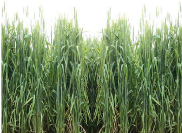
Fig. 4.5: Wheat Cultivation

Wheat: This is the second most important cereal crop. It is the main food crop, in north and north-western part of the country. This rabi crop requires a cool growing season and a bright sunshine at the time of ripening. It requires 50 to 75 cm of annual rainfall evenly-distributed over the growing season. There are two important wheat-growing zones in the country – the Ganga-Satluj plains in the north-west and black soil region of the Deccan. The major wheat-producing states are Punjab, Haryana, Uttar Pradesh, Bihar, Rajasthan and parts of Madhya Pradesh.