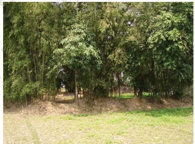
Fig. 4.3: Bamboo plantation in North-east

Karnataka are some of the important plantation crops grown in these states. Since the production is mainly for market, a well-developed network of transport and communication connecting the plantation areas, processing industries and markets plays an important role in the development of plantations.