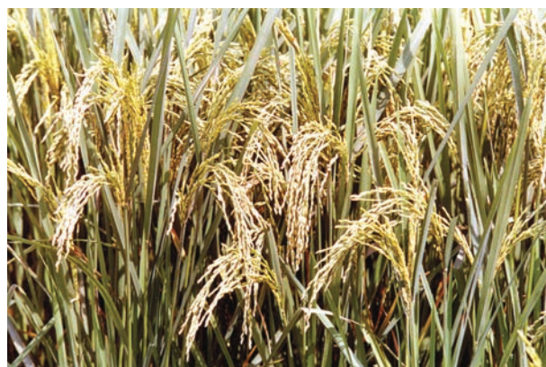
Fig. 4.4 (b): Rice is ready to be harvested in the field