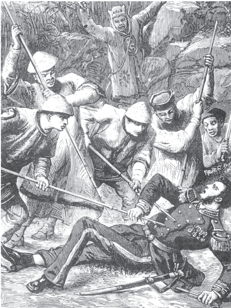
Fig. 3 – Francis Garnier, a French officer who led an attack against the ruling Nguyen dynasty, being killed by soldiers of the court.

Garnier was part of the French team that explored the Mekong river. In 1873 he was commissioned by the French to try and establish a French colony in Tonkin in the north. Garnier carried out an attack on Hanoi, the capital of Tonkin, but was killed in the fight.