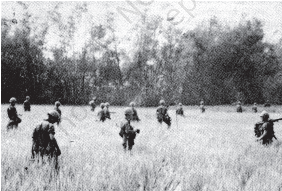
Fig. 12 – American soldiers searching rice fields for Vietcongs.

US entry into the war marked a new phase that proved costly to the Vietnamese as well as to the Americans. From 1965 to 1972, over 3,403,100 US services personnel served in Vietnam (7,484 were women). Even though the US had advanced technology and good