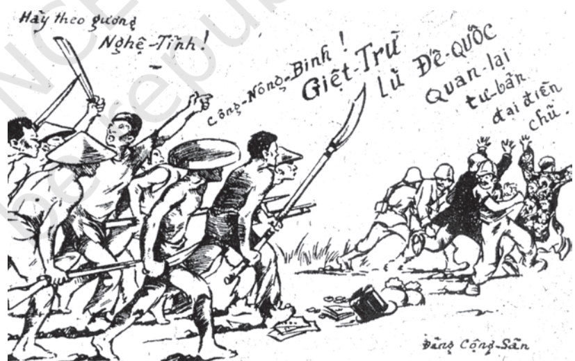
Fig. 9 – Cartoon of Vietnamese nationalists chasing away imperialists. In all such nationalist representations of struggle the nationalists appear heroic, marching ahead, while the imperial forces flee.

Soon, however, the anti-imperialist movement in Vietnam came under a new type of leadership.