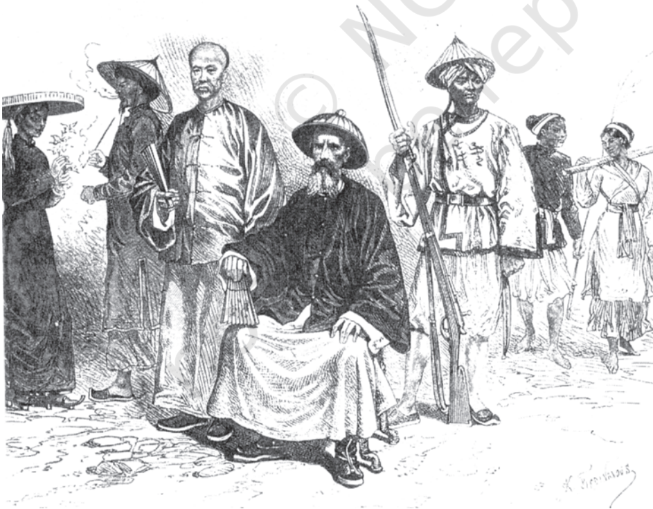
Fig. 5 – A French weapons merchant, Jean Dupuis, in Vietnam in the late nineteenth century.

Indentured labour – A form of labour widely used in the plantations from the mid-nineteenth century. Labourers worked on the basis of contracts that did not specify any rights of labourers but gave immense power to employers. Employers could bring criminal charges against labourers and punish and jail them for non-fulfilment of contracts.