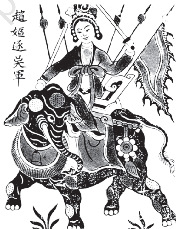
Fig. 17 – Image of Trieu Au worshipped as a sacred figure. Rebels who resisted Chinese rule continue to be celebrated.

Other women rebels of the past were part of the popular nationalist lore. One of the most venerated was Trieu Au who lived in the third century CE. Orphaned in childhood, she lived with her brother. On growing up she left home, went into the jungles, organised a large army and resisted Chinese rule. Finally, when her army was