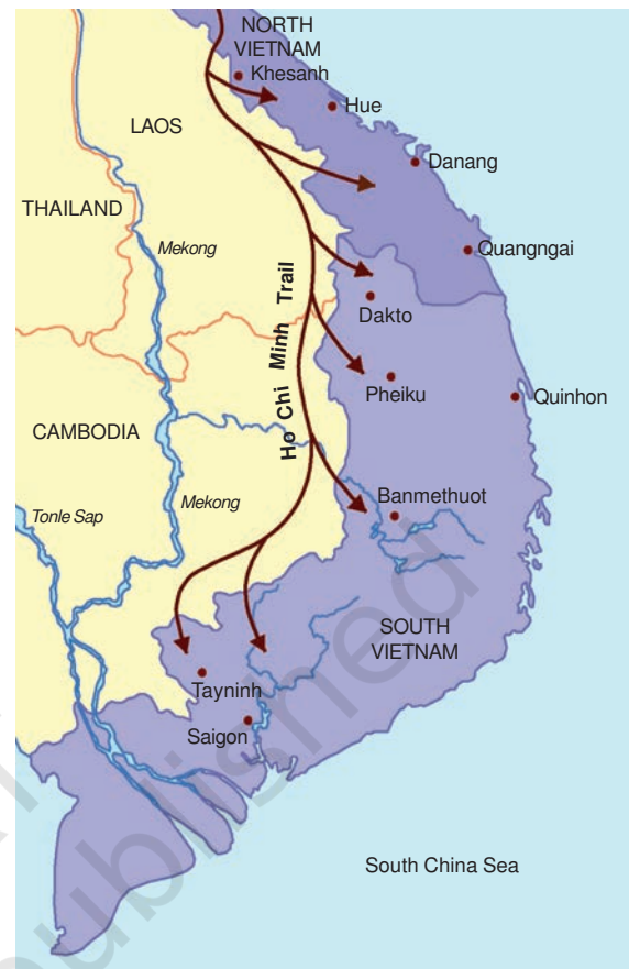
Fig. 14 – The Ho Chi Minh trail. Notice how the trail moved through Laos and Cambodia.

Most of the trail was outside Vietnam in neighbouring Laos and Cambodia with branch lines extending into South Vietnam. The US regularly bombed this trail trying to disrupt supplies, but efforts to destroy this important supply line by intensive bombing failed because they were rebuilt very quickly.