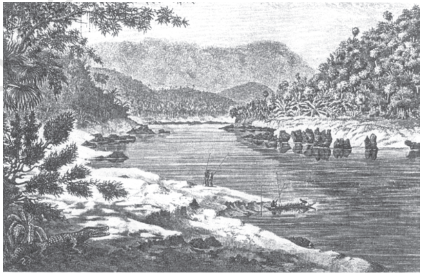
Fig. 4 – The Mekong river, engraving by the French Exploratory Force, in which Garnier participated.

French troops landed in Vietnam in 1858 and by the mid-1880s they had established a firm grip over the northern region. After the Franco-Chinese war the French assumed control of Tonkin and Annam and, in 1887, French Indo-China was formed. In the following decades the French sought to consolidate their position, and people in Vietnam began reflecting on the nature of the loss that Vietnam was suffering. Nationalist resistance developed out of this reflection.