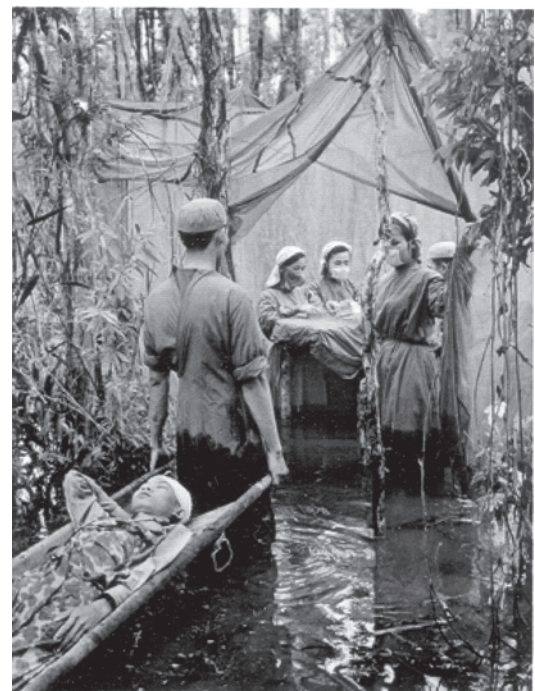
Fig. 19 – Vietnamese women doctors nursing the wounded.

Stories about women showed them eager to join the army. A common description was: 'A rosy-cheeked woman, here I am fighting side by side with you men. The prison is my school, the sword is my child, the gun is my husband.'