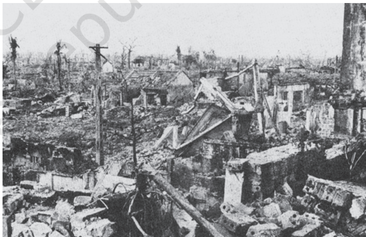
Fig. 13 – In December 1972 Hanoi was bombed.

The tonnage of bombs, including chemical arms, used during the US intervention (mostly against civilian targets) in Vietnam exceeds that used throughout the Second World War.