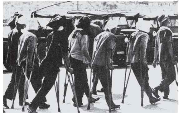
Fig. 20 – North Vietnamese prisoners in South Vietnam being released after the accord .

The widespread questioning of government policy strengthened moves to negotiate an end to the war. A peace settlement was signed in Paris in January 1974. This ended conflict with the US but fighting between the Saigon regime and the NLF continued. The NLF occupied the presidential palace in Saigon on 30 April 1975 and unified Vietnam.