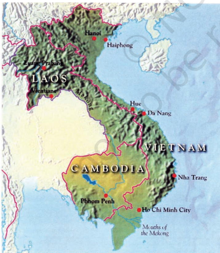
Fig.1 – Map of Indo-China.

If you see the historical experience of Indo-China in relation to that of India, you will discover important differences in the way colonial empires functioned and the anti-imperial movement developed. By looking at such differences and similarities you can understand the variety of ways in which nationalism has developed and shaped the contemporary world.