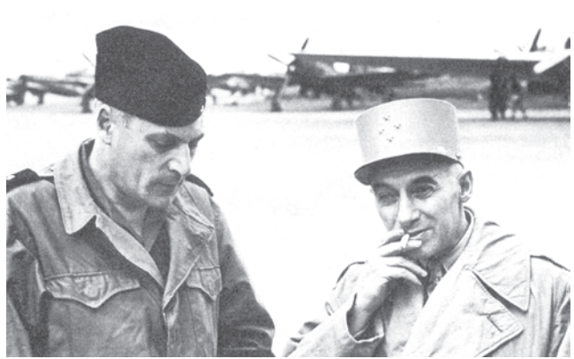
Fig. 10 – The French Commander in Indo-China, General Henri Navarre (right).

With the help of the Ho Chi Minh government in the north, the NLF fought for the unification of the country. The US