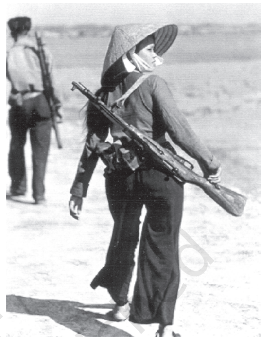
Fig. 18 – With a gun in one hand.

By the 1970s, as peace talks began to get under way and the end of the war seemed near, women were no longer represented as warriors. Now the image of women as workers begins to predominate. They are shown working in agricultural cooperatives, factories and production units, rather than as fighters.