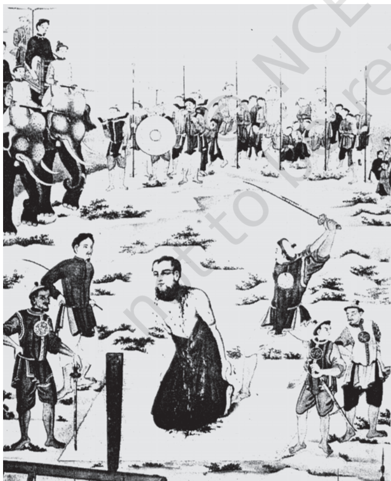
Fig. 8 – The execution of Father Borie, a Catholic missionary.

Confucius (551-479 BCE), a Chinese thinker, developed a philosophical system based on good conduct, practical wisdom and proper social relationships. People were taught to respect their parents and submit to elders. They were told that the relationship between the ruler and the people was the same as that between children and parents.