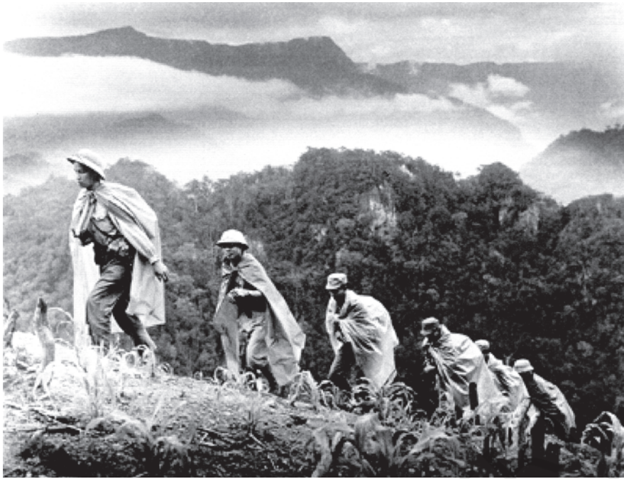
Fig.16 – On the Ho Chi Minh trail.