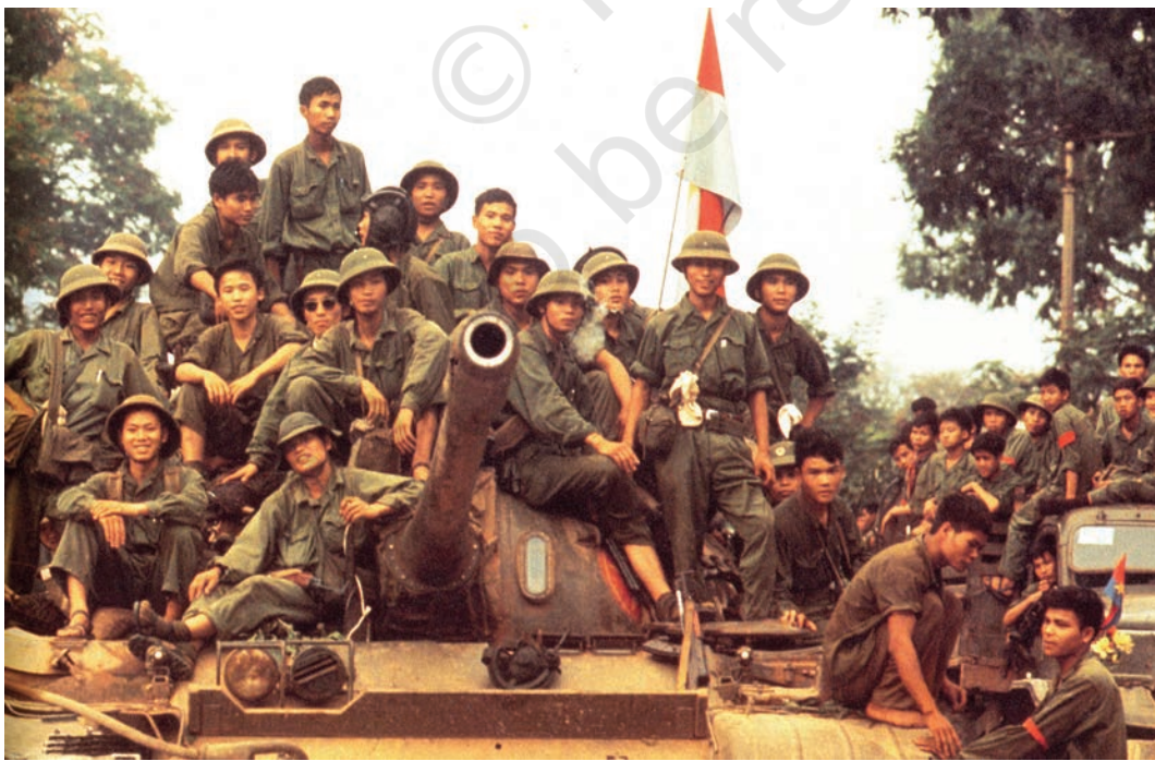
Fig. 21 – Vietcong soldiers pose triumphantly atop a tank after Saigon is liberated. What does this image tell us about the nature of Vietnamese nationalism?