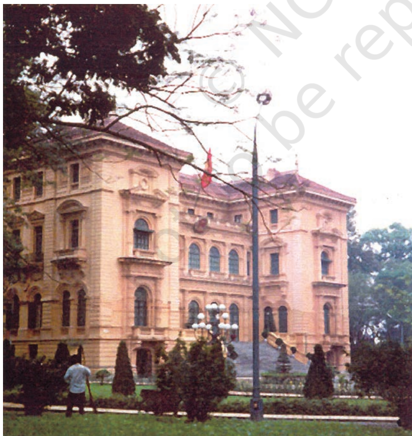
Fig. 7 – Modern Hanoi. Colonial buildings like this one came up in the French part of Hanoi.

The French part of Hanoi was built as a beautiful and clean city with wide avenues and a well-laid-out sewer system, while the ‘native