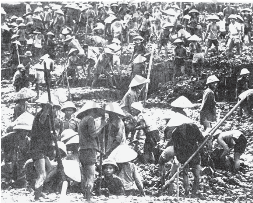
Fig. 15 – Rebuilding damaged roads. Roads damaged by bombs were quickly rebuilt.