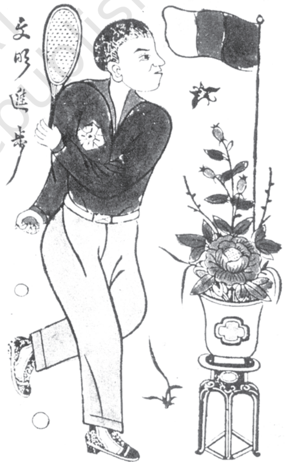
Fig. 6 – A local caricature ridiculing the Vietnamese who has been westernised. Abandoning his own culture, he has begun wearing Western clothes and playing tennis.