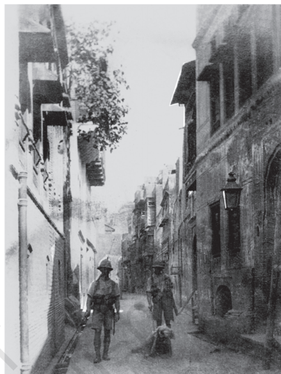
Fig. 3 – General Dyer's 'crawling orders' being administered by British soldiers, Amritsar, Punjab, 1919.

In his famous book Hind Swaraj (1909) Mahatma Gandhi declared that British rule was established in India with the cooperation of