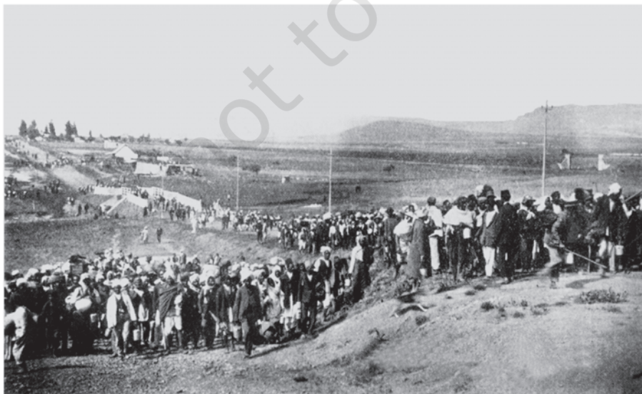
Fig. 2 – Indian workers in South Africa march through Volksrust, 6 November 1913.

Forced recruitment – A process by which the colonial state forced people to join the army