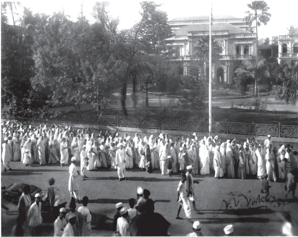
Fig. 9 – Women join nationalist processions. During the national movement, many women, for the first time in their lives, moved out of their homes on to a public arena. Amongst the marchers you can see many old women, and mothers with children in their arms.

picketed foreign cloth and liquor shops. Many went to jail. In urban areas these women were from high-caste families; in rural areas they came from rich peasant households. Moved by Gandhiji's call, they began to see service to the nation as a sacred duty of women. Yet, this increased public role did not necessarily mean any radical change in the way the position of women was visualised. Gandhiji was convinced that it was the duty of women to look after home and hearth, be good mothers and good wives. And for a long time the Congress was reluctant to allow women to hold any position of authority within the organisation. It was keen only on their symbolic presence.