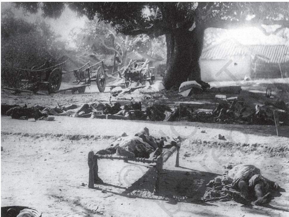
Fig. 5 – Chauri Chaura, 1922.

The visions of these movements were not defined by the Congress programme. They interpreted the term swaraj in their own ways, imagining it to be a time when all suffering and all troubles would be over. Yet, when the tribals chanted Gandhiji's name and raised slogans demanding ' Swatantra Bharat ', they were also emotionally relating to an all-India agitation. When they acted in the name of Mahatma Gandhi, or linked their movement to that of the Congress, they were identifying with a movement which went beyond the limits of their immediate locality.