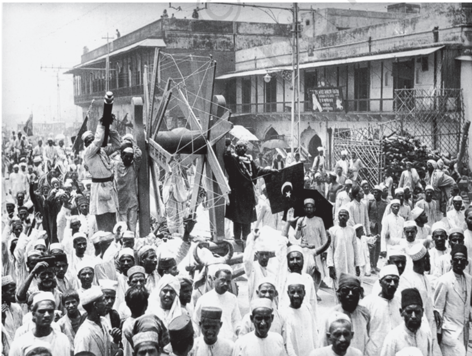
Fig. 4 – The boycott of foreign cloth, July 1922. Foreign cloth was seen as the symbol of Western economic and cultural domination.

Boycott – The refusal to deal and associate with people, or participate in activities, or buy and use things; usually a form of protest