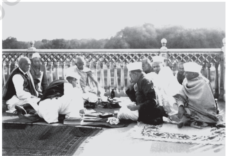
Fig. 6 – Meeting of Congress leaders at Allahabad, 1931. Apart from Mahatma Gandhi, you can see Sardar Vallabhbhai Patel (extreme left), Jawaharlal Nehru (extreme right) and Subhas Chandra Bose (fifth from right).

Lala Lajpat Rai was assaulted by the British police during a peaceful demonstration against the Simon Commission. He succumbed to injuries that were inflicted on him during the demonstration.