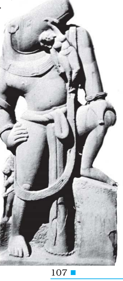
TRADERS, KINGS AND PILGRIMS

This magnificent statue is of a special form of Vishnu, the Varaha or boar. According to the Puranas (see Chapter 12) Vishnu took the shape of a boar in order to rescue the earth, which had sunk into water. Here the earth is shown as a woman.