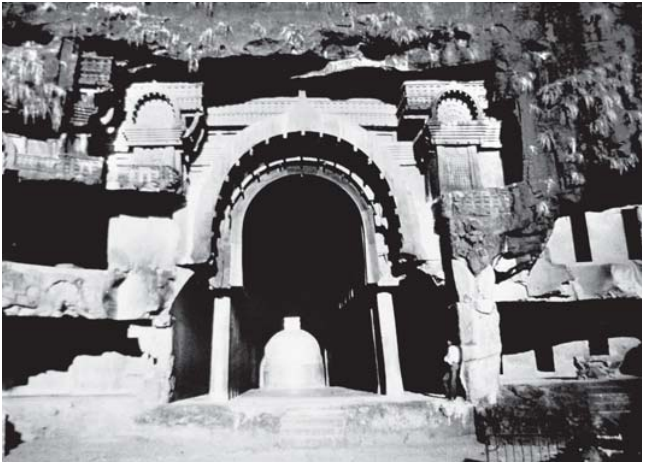
A cave at Karle, Maharashtra

Read page 100 once more. Can you think of how Buddhism spread to these lands?