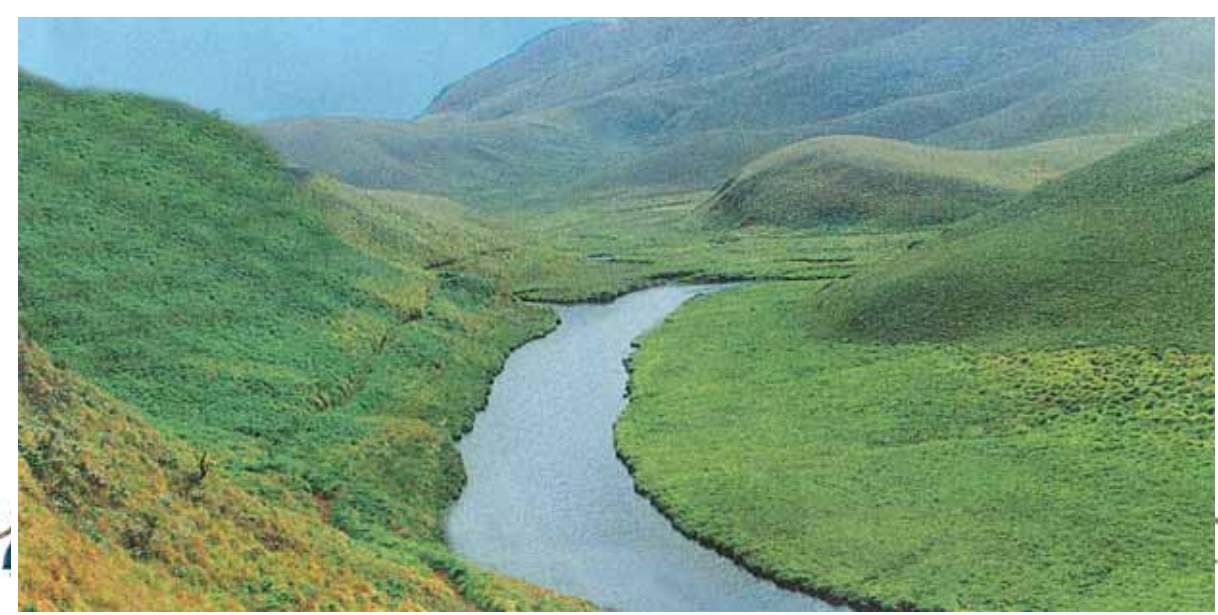
Quiet flows the Cauvery despite being at the centre of heated conflict between two states for the last 30 years.

A conflict arises because both dams are on the same river. The downstream dam in Tamil Nadu can only be filled up if water is released from the upstream one located in Karnataka. Therefore, both states can't get as much water as they need for people in their states. This leads to conflict. The central government has to step in and see that a fair distribution is worked out for both states.