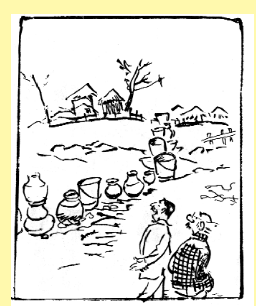
Not bad! One of the taps in the nearby village must be getting water!