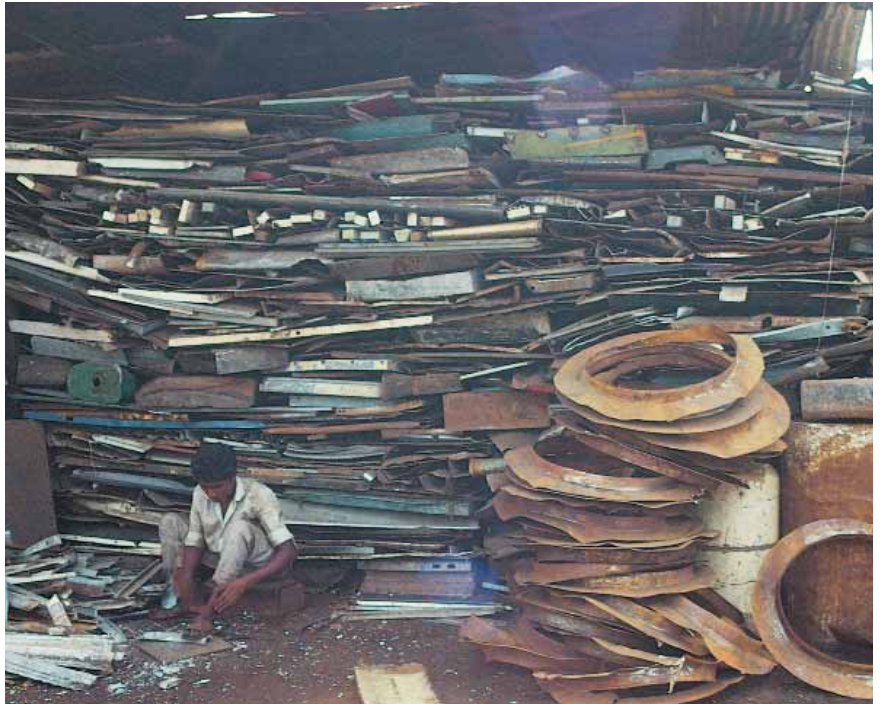
Recycling is not a new thing. People like the man in the photo above have been recycling paper, metal, glass and plastic for a long time. The kabadi wallah plays a major role in recycling household plastic and paper, including your note books.

Jehangir ate his kababs at top speed and as he wolfed them down he asked loudly from the kitchen, "Yasmin Khala where does the garbage that the Municipal Corporation collects go to?". The others were still eating when Yasmin Khala began to answer, "This question has an interesting answer. As you know you can usually find garbage lying all over the street. Earlier even our neighbourhood used to have garbage lying all over; and if this