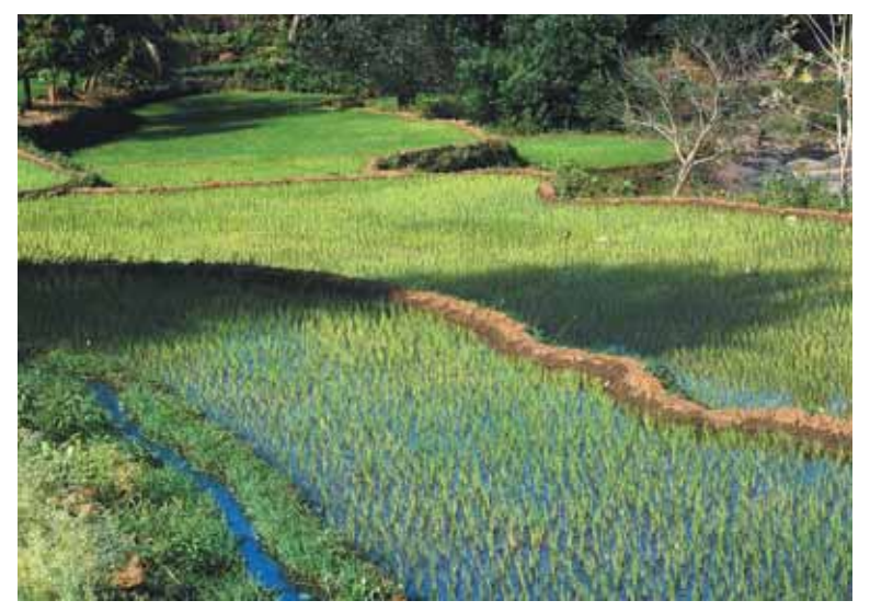
Transplanted paddy growing in a few of Ramalingam's 20 acres. A result of hard labour performed by agricultural workers like Thulasi.

4. What are the similarities and differences between Sekar's and Thulasi's lives? Your answer could be based on the land that they have, their need to work on the land that belongs to others, or loans that they need and their earnings.