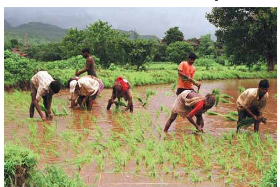
Transplanting paddy is back-breaking work.

The village is surrounded by low hills. Paddy is the main crop that is grown in irrigated lands. Most of the families earn a living through agriculture.