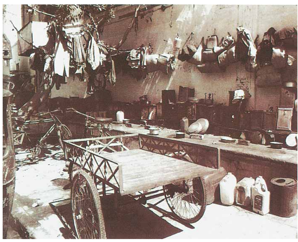
Often workers who make a living in the city are forced to set up their homes on the street as well. Below is a space where several workers leave their belongings during the day and cook their meals at night.

Vendors sell things that are often prepared at home by their families who purchase, clean, sort and make them ready to sell. For example, those who sell food or snacks on the street, prepare most of these at home.