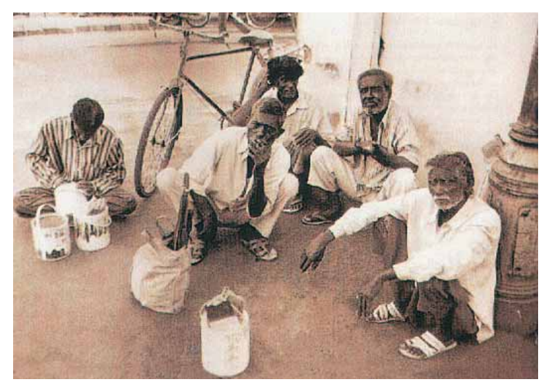
At labour chowk, daily wage workers wait with their tools for people to come and take them for work.

trucks in the market, dig pipelines and telephone cables and also build roads. There are thousands of such casual workers in the city.