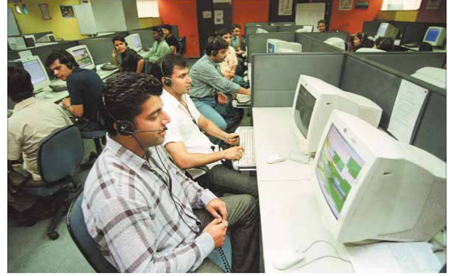
Working in Call Centres is a new form of employment in the big cities. A Call Centre is a centralised office that deals with problems and questions that consumers/ customers have regarding goods purchased and services like banking, ticket booking, etc. Call Centres are generally set up as large rooms with work stations that include a computer, a telephone set and supervisor's stations. India has become a major centre not only for Indian companies but also foreign companies. They set up Call Centres here as they can get people who can speak English and will work for lower wages.

3. Would you say that domestic workers like housemaids are also casual workers? Why? Describe the workday of one such woman detailing the work she does in other peoples' houses.