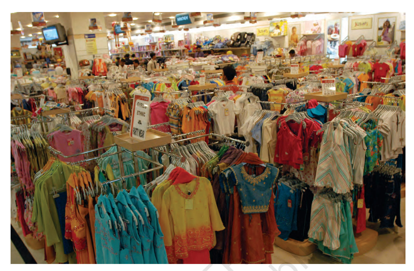
Did you know that the readymade clothes that you buy require the work of so many different persons?