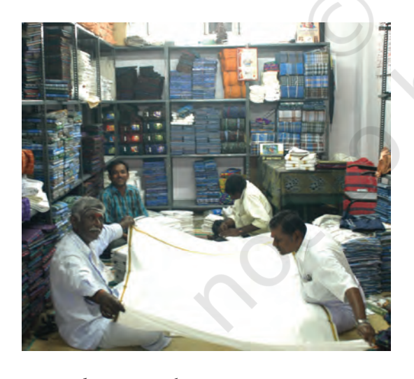
A shop in Erode.

On market days, you would also find weavers bringing cloth that has been made on order from the merchant. These merchants supply cloth on order to garment manufacturers and exporters around the country. They purchase the yarn and give instructions to the weavers about the kind of cloth that is to be made. In the following example, we can see how this is done.