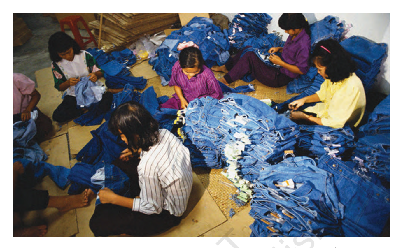
The garment exporting factory near Delhi

The Erode merchant supplies the cotton cloth produced by the weavers to a garment exporting factory near Delhi. The garment exporting factory will use the cloth to make shirts. The shirts will be exported to foreign buyers. Among the foreign buyers are businesspersons from the US and Europe who run a chain of stores. These large stores do business strictly on their own terms. They demand the lowest prices from the supplier. In addition, they set high standards for quality of production and timely delivery. Any defects or delay in delivery is dealt with strictly. So, the exporter tries his best to meet the conditions set by these powerful buyers.