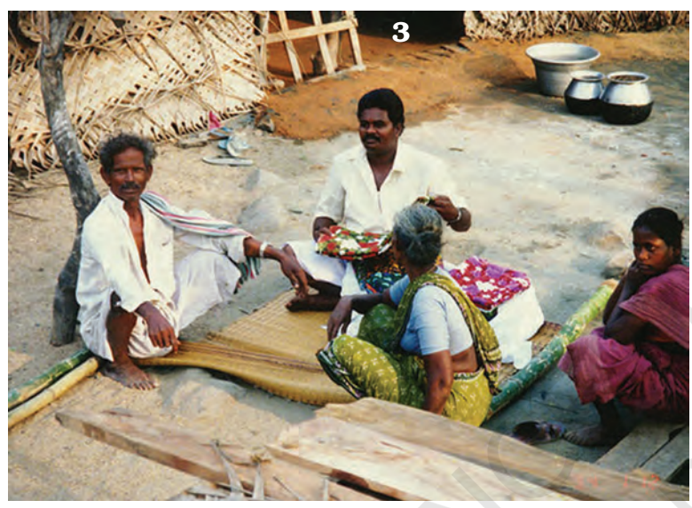
Putting-out system-weavers producing cloth at home

The merchant distributes work among the weavers based on the orders he has received for cloth. The weavers get the yarn from the merchant and supply him the cloth. For the weavers, this arrangement seemingly has two advantages. The weavers do not have to spend their money on purchase of yarn. Also, the problem of selling the finished cloth is taken care of. Weavers know from the outset what cloth they should make and how much of it is to be woven.