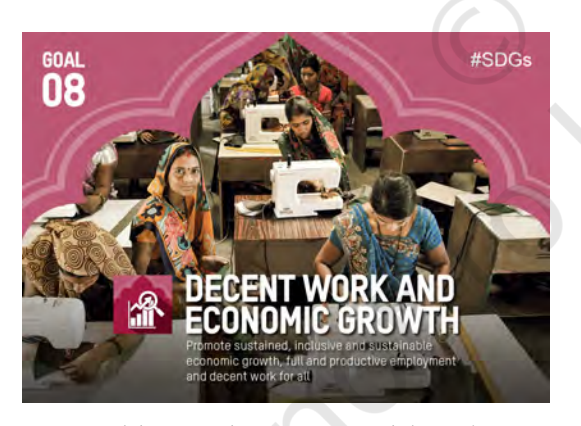
Sustainable Development Goal (SDG) www.in.undp.org

that get the maximum earnings from the market. These are the people who have money and own the factories, the large shops, large land holdings, etc. The poor have to depend on the rich and the powerful for various things. They have to depend for loans (as in the case of Swapna, the small farmer), for raw materials and marketing of their goods (weavers in the putting out system), and most often for employment (workers at the garment factory). Because of this dependence, the poor are exploited in the market. There are ways to overcome these such as forming cooperatives of producers and ensuring that laws are followed strictly. In the last chapter, we will read about how one such fish-workers' cooperative was started on the Tawa river.