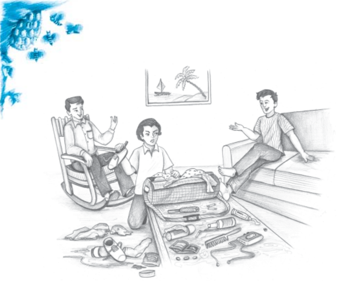
I found the toothbrush inside a boot.

must have been before the world was created, and when chaos reigned. Of course, I found George's and Harris's eighteen times over, but I couldn't find my own. I put the things back one by one, and held everything up and shook it. Then I found it inside a boot. I repacked once more.