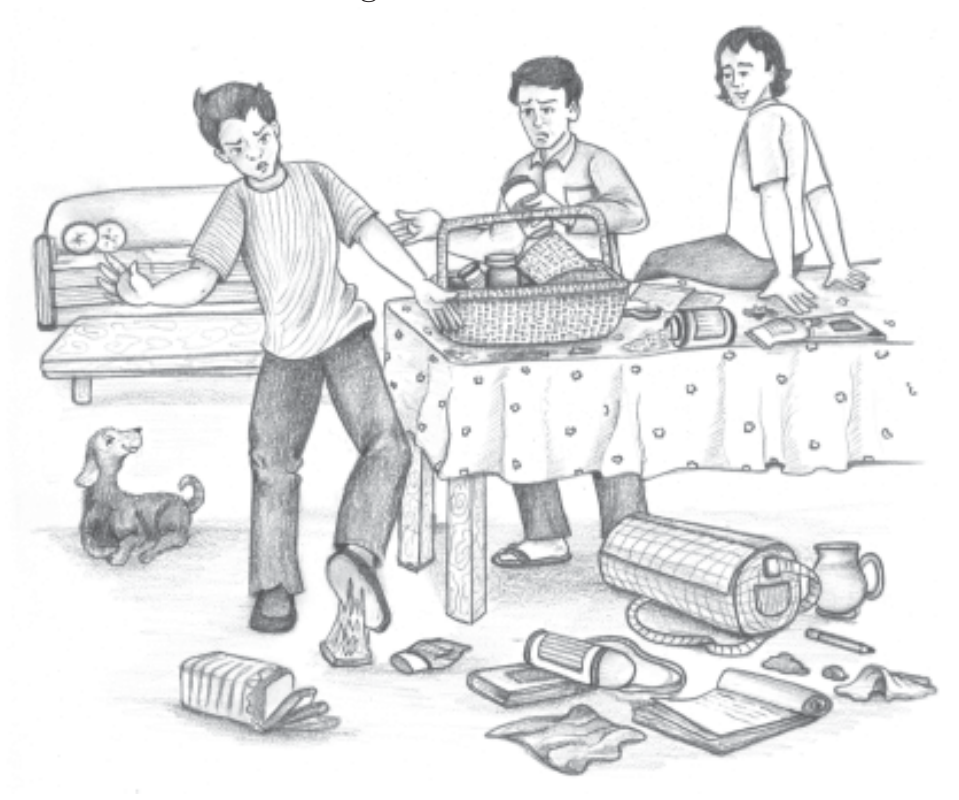
George trod on the butter.

And then it was George's turn, and he trod on trod on: stepped on the butter. I didn't say anything, but I came over and sat on the edge of the table and watched them.