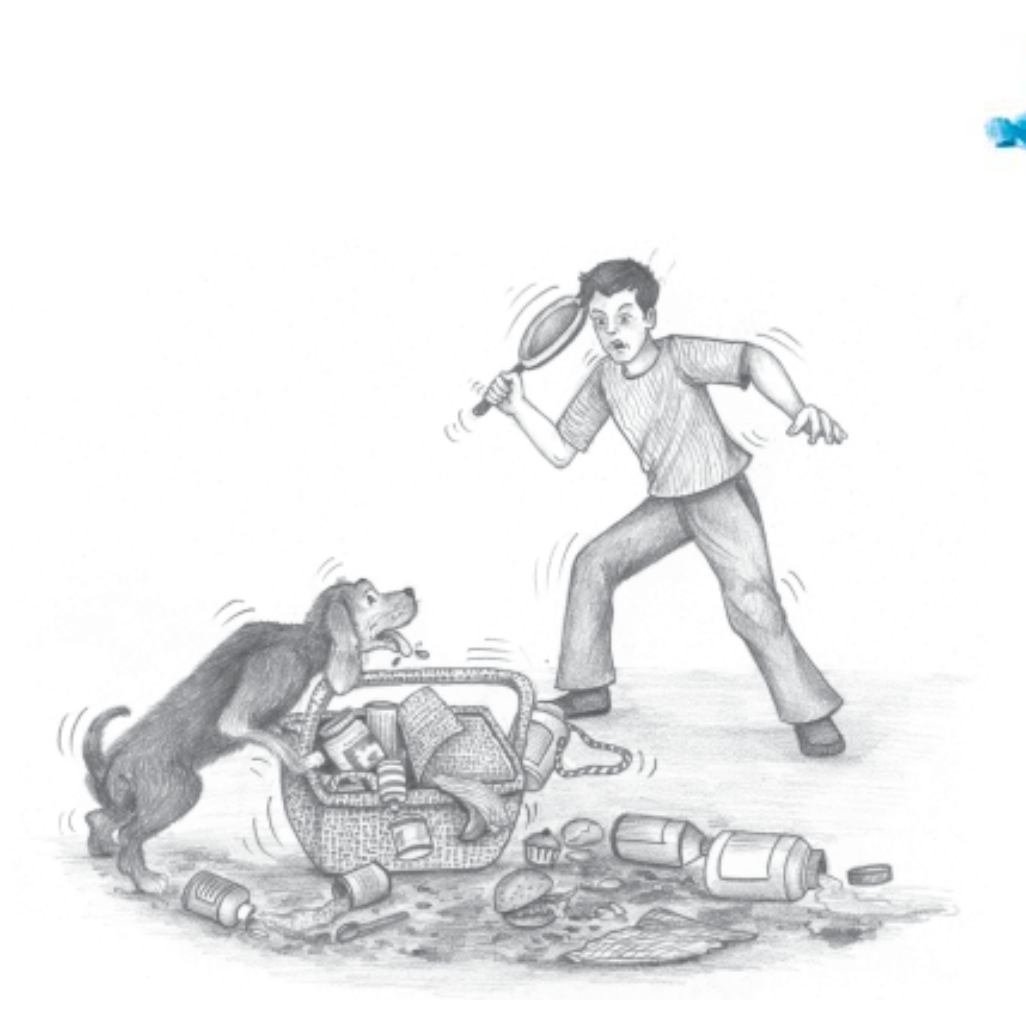
Montmorency got into the hamper... before Harris could land him with the frying-pan.

things thrown at his head, then he feels his day has not been wasted.