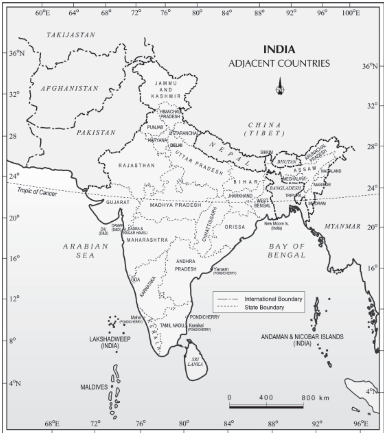
Figure 1.5 : India and Adjacent Countries

Sri Lanka and Maldives. Sri Lanka is separated from India by a narrow channel of sea formed by the Palk Strait and the Gulf of Mannar while Maldives Islands are situated to the south of the Lakshadweep Islands.