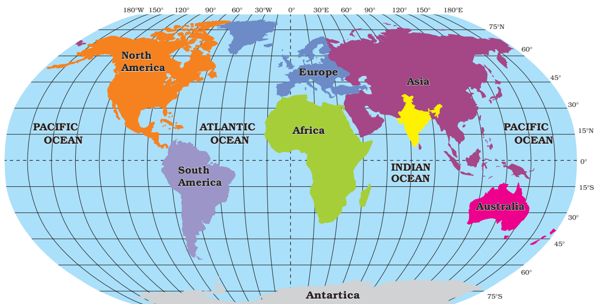
Figure 1.1 : India in the World

The land mass of India has an area of 3.28 million square km. India's total area accounts for about 2.4 per cent of the total geographical