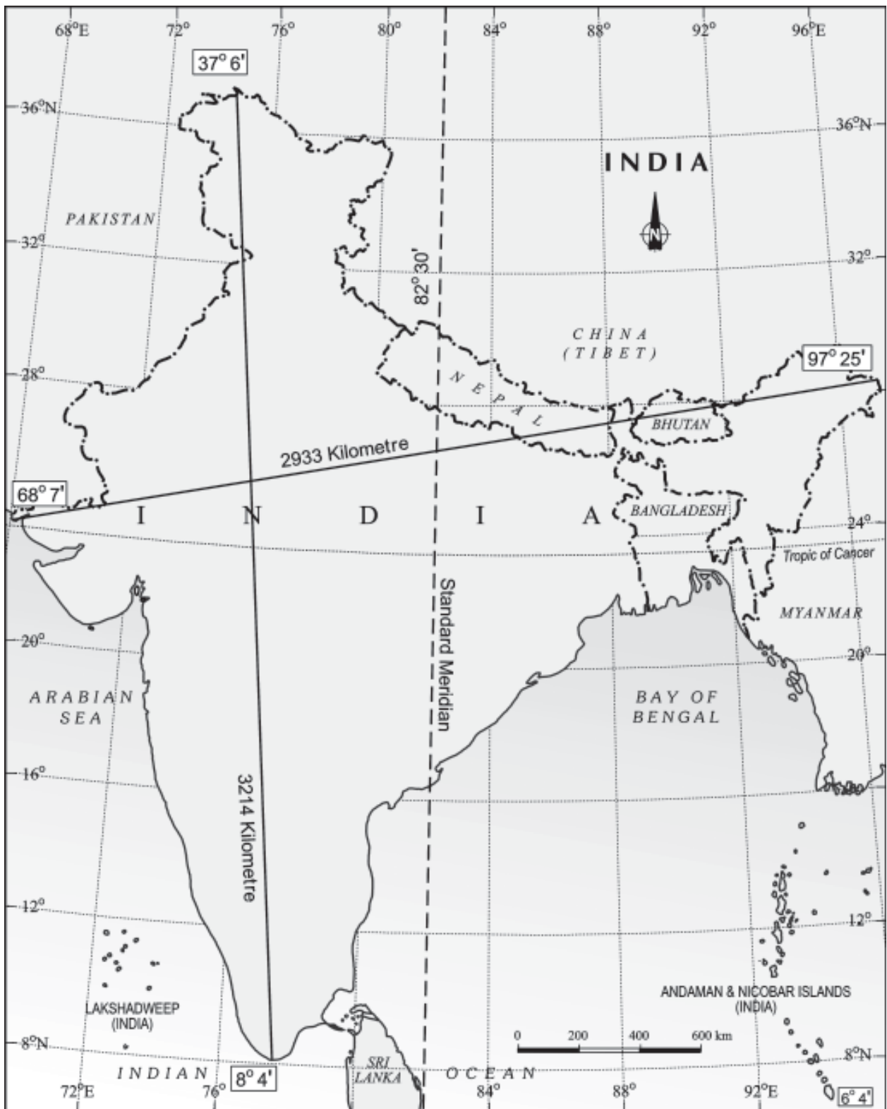
Figure 1.3 : India : Extent and Standard Meridian